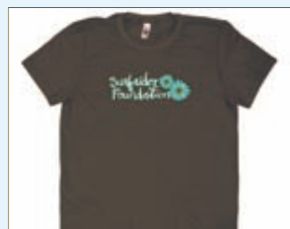
DAISY II S/S organic brown cotton t-shirt (women's only) L-XL $22